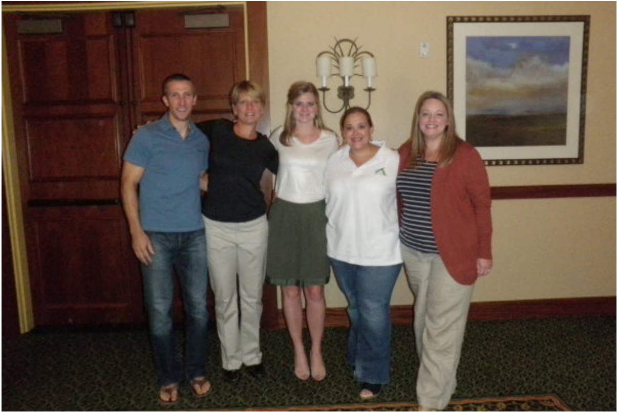
OLYMPUS DIGITAL CAMERA